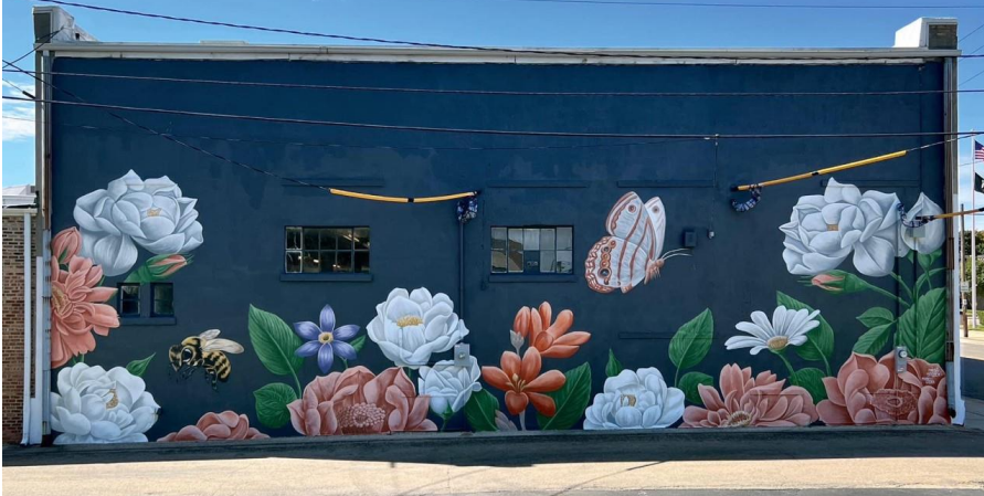
Large mural located on the back of the building located at 429 Lincoln Highway in Downtown Rochelle. Completed by Amanda & Matt Steder.