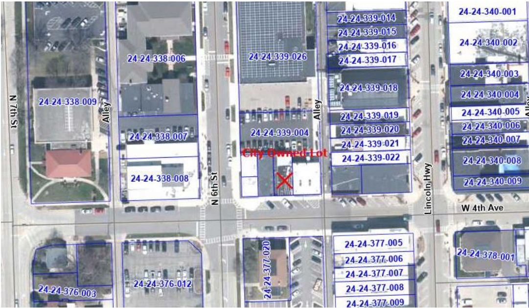
517 W 4 th Avenue lot- Urban park to be created.

**Private properties may also be proposed locations. Written permission must be obtained from the property owner within the proposal.**