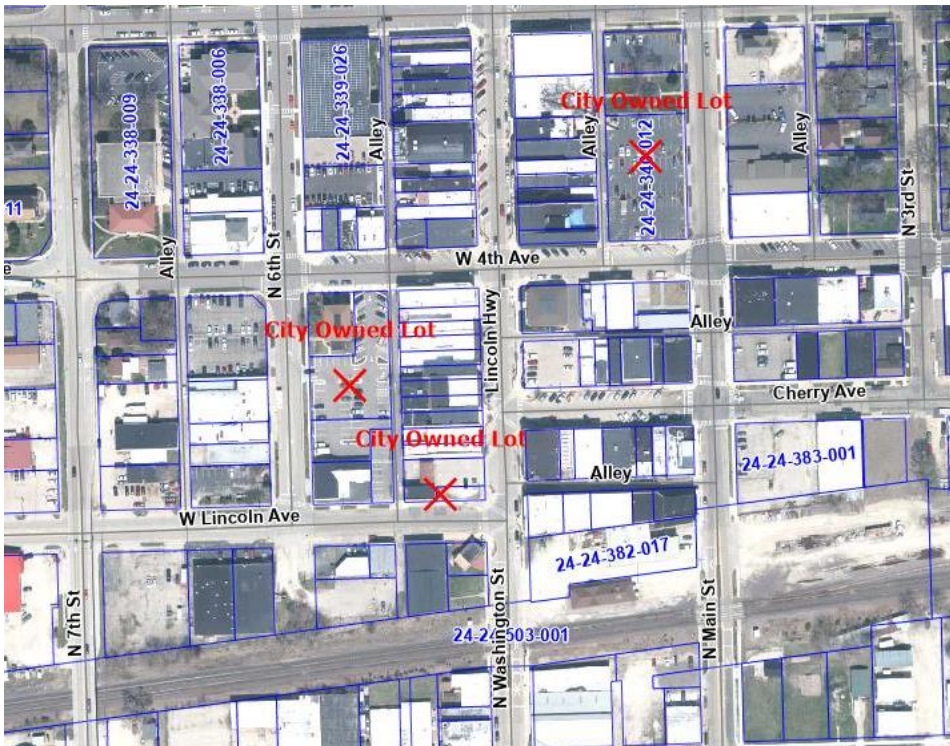
Gazabo Area on South Main Street Corner of Lincoln Highway and Lincoln Avenue 6 th Street behind the Flagg Township Museum